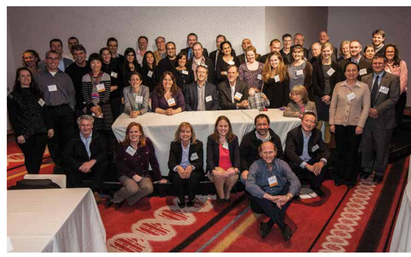
Attendees at the Drug Targeting the Lysosome Workshop.

Lysosome Workshop," which was held at the NYAS Conference Center at the World Trade Center, both academic and pharmaceutical researchers discussed how to work together towards common goals. There were many action items resulting from the meeting as well as an accessible and educational podcast.