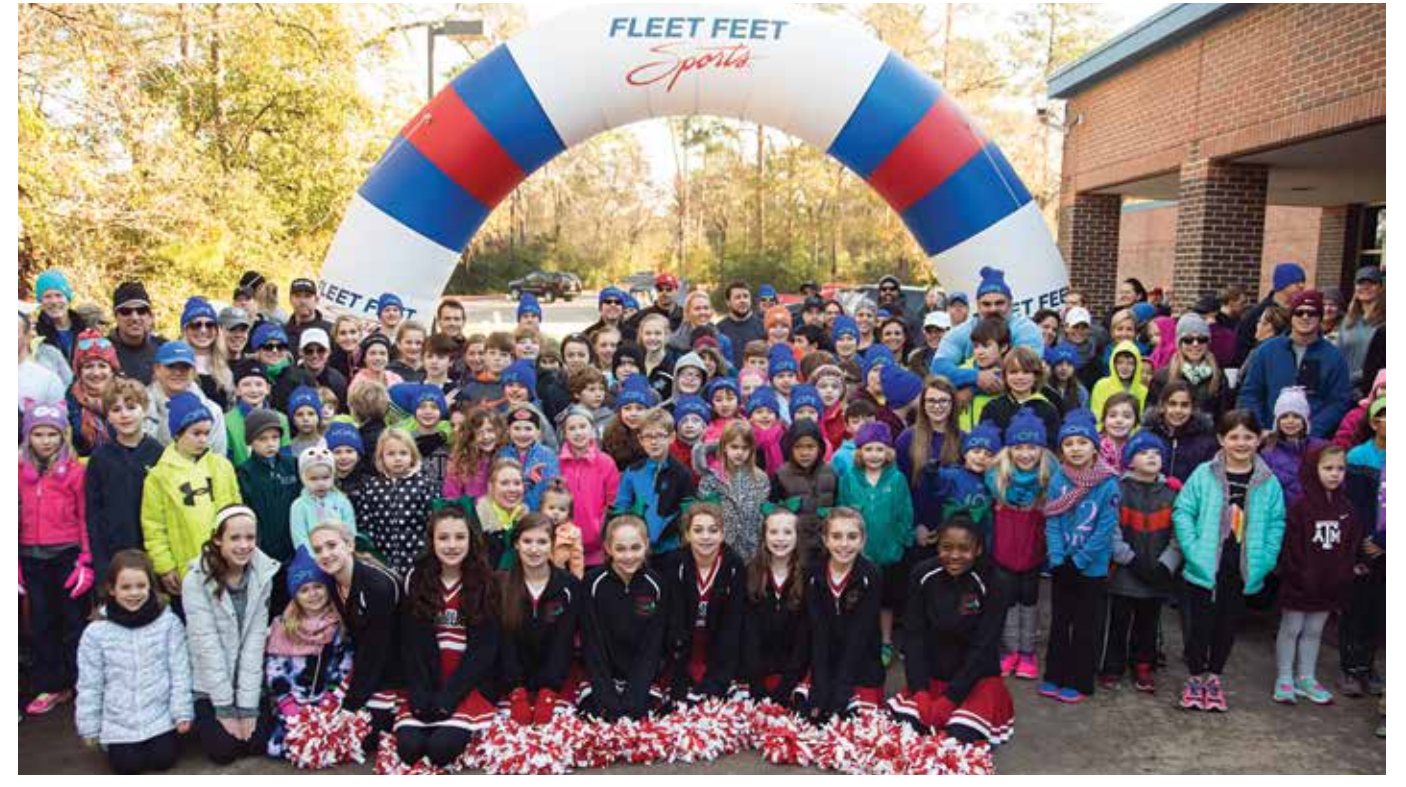
HOPE supporters gather at The Warrior Run and Rally