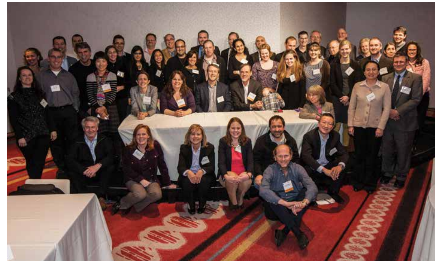
Attendees at the Drug Targeting the Lysosome Workshop.

Lysosome Workshop,” which was held at the NYAS Conference Center at the World Trade Center, both academic and pharmaceutical researchers discussed how to work together towards common goals. There were many action items resulting from the meeting as well as an accessible and educational podcast.