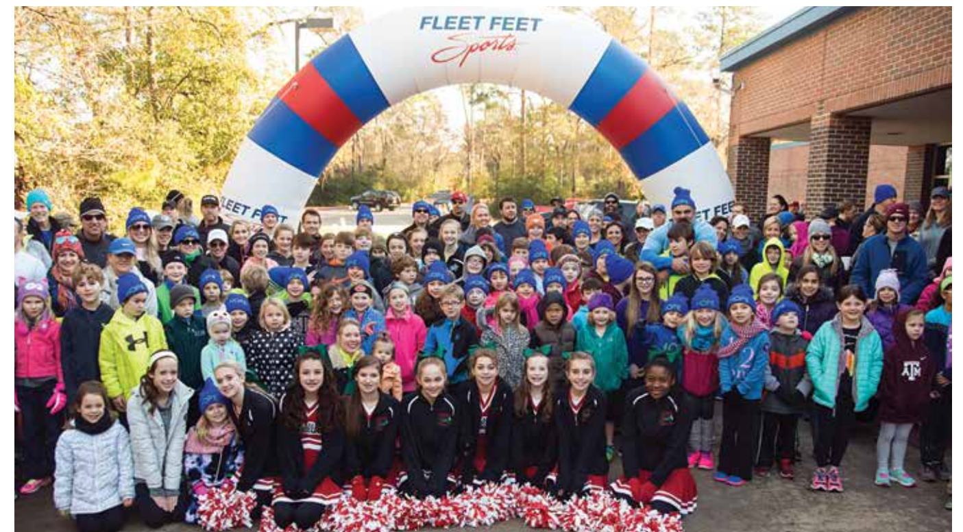
HOPE supporters gather at The Warrior Run and Rally